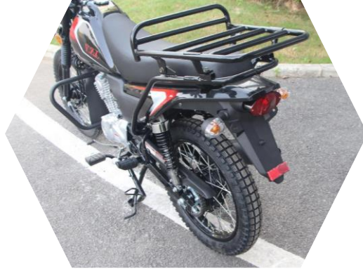
Widened and thickened seat cushion