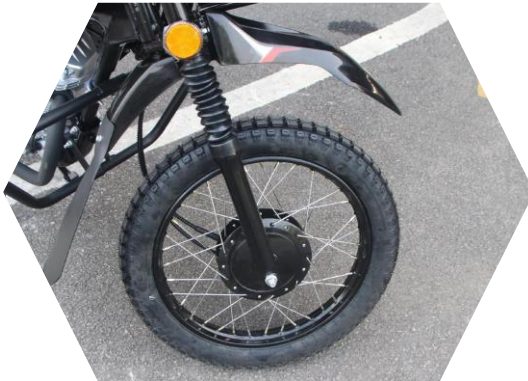
Large diameter front drum ( \Phi 130 ), improve braking performance