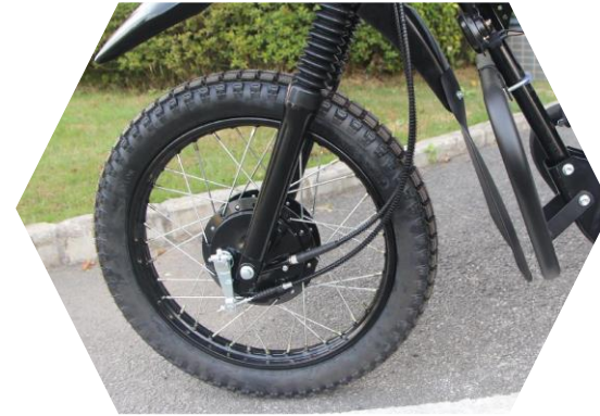
Off road tire