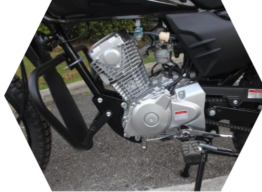
NE125 engine, Superior performance at low and medium speeds