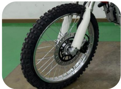
High quality Off-road tires, antislid, wearproof, sporting, free to cross any road.