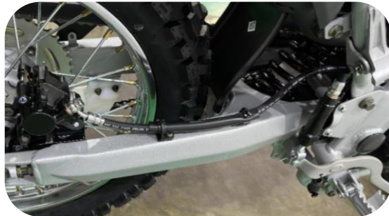
High-intensity swing arm with more thicker pipes, providing more comfortable, smooth and safety riding.