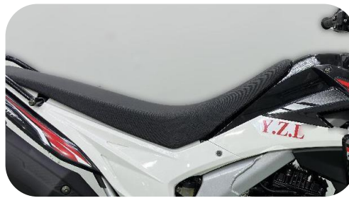
Longer high resilience flexible seat in arc shape, meeting different people needs, easy and comfortable driving.