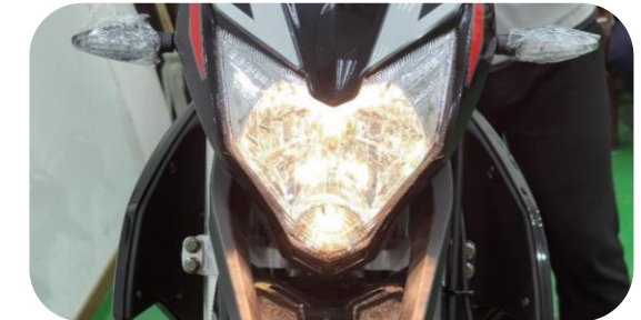
New alien style headlamp, beautiful appearance, wider and brighter illumination and better for night riding.