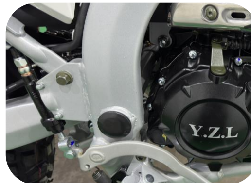
New plate frame, improved frame bearing capacity and Anti-fatigue capacity a lot. Better strength, lower vibration, more durable.