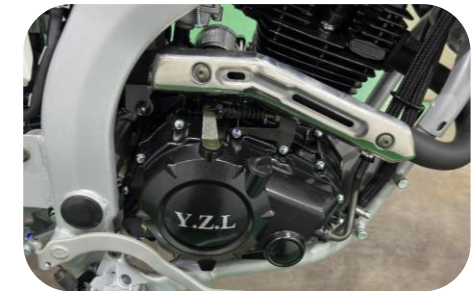
RE250 high-quality 6 speed engine produce more power, more stability, and vigorous sound.