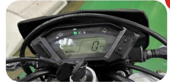
Brand new digit LED meter, clear & accurate. 3 color options for the panel, making riding adunbant view enjoyment.