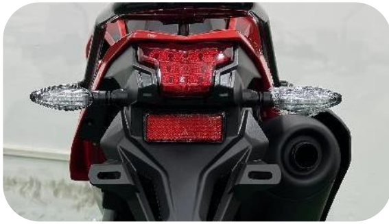
Fashion and dynamic LED taillight gives more striking illumination longer life-time and lower energy consumption.